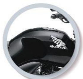
Pearl Igneous Black