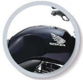
Pearl Siren Blue