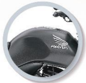
Matt. Axis Grey Metallic