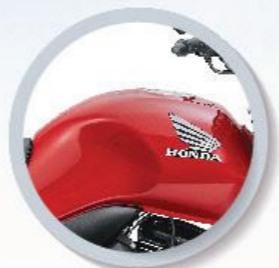
Imperial Red Metallic